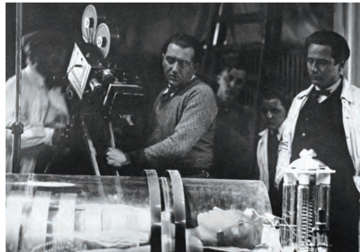
UTOPIA: Fritz Lang (center) turns his camera on a robot created to resurrect a lost love in the iconic futuristic film Metropolis (1927). Lang conceived the art deco, German-expressionist city based on his first glimpse of the "glaring lights and the tall buildings" of New York.