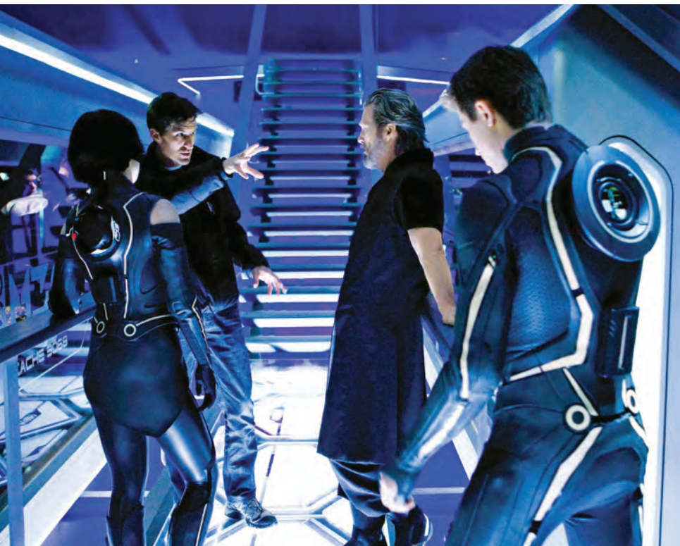
ROCKET MAN: (opposite) For The Martian (2015), director Ridley Scott, with actor Matt Damon and crew, shot Mars' exteriors on the red-colored desert of Wadi Rum in Jordan. He also consulted with NASA to accurately portray space travel and the Martian landscape; (above) First-time director Joseph Kosinski blocks actors Olivia Wilde, Jeff Bridges, and Garrett Hedlund on the set of Tron: Legacy (2010). The director's background in architecture influenced the look of the film's labyrinthine virtual world.

From Méliès to Spielberg, directors have long wondered what life would look like in the future. With the help of production and costume design, here's how directors visualized the shape of things to come.