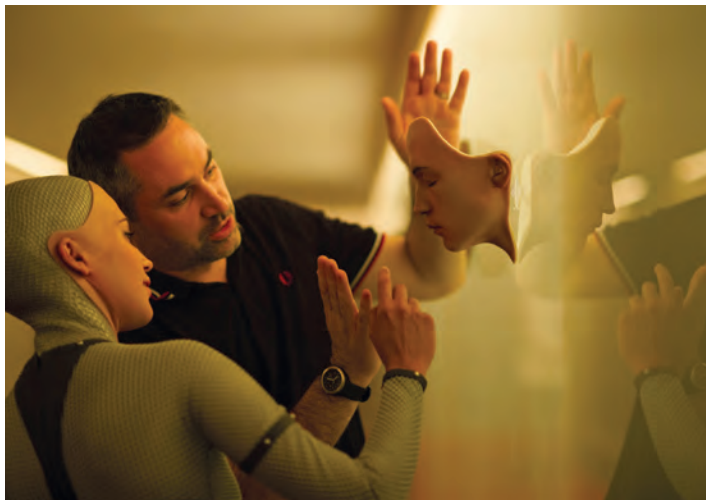
HANDS-ON: Alex Garland shows actor Alicia Vikander a mold for an A.I.'s face in Ex Machina (2015). When asked how far into the future the film was set, Garland responded, "Ten minutes from now," citing how close today's technology has come to artificial intelligence.