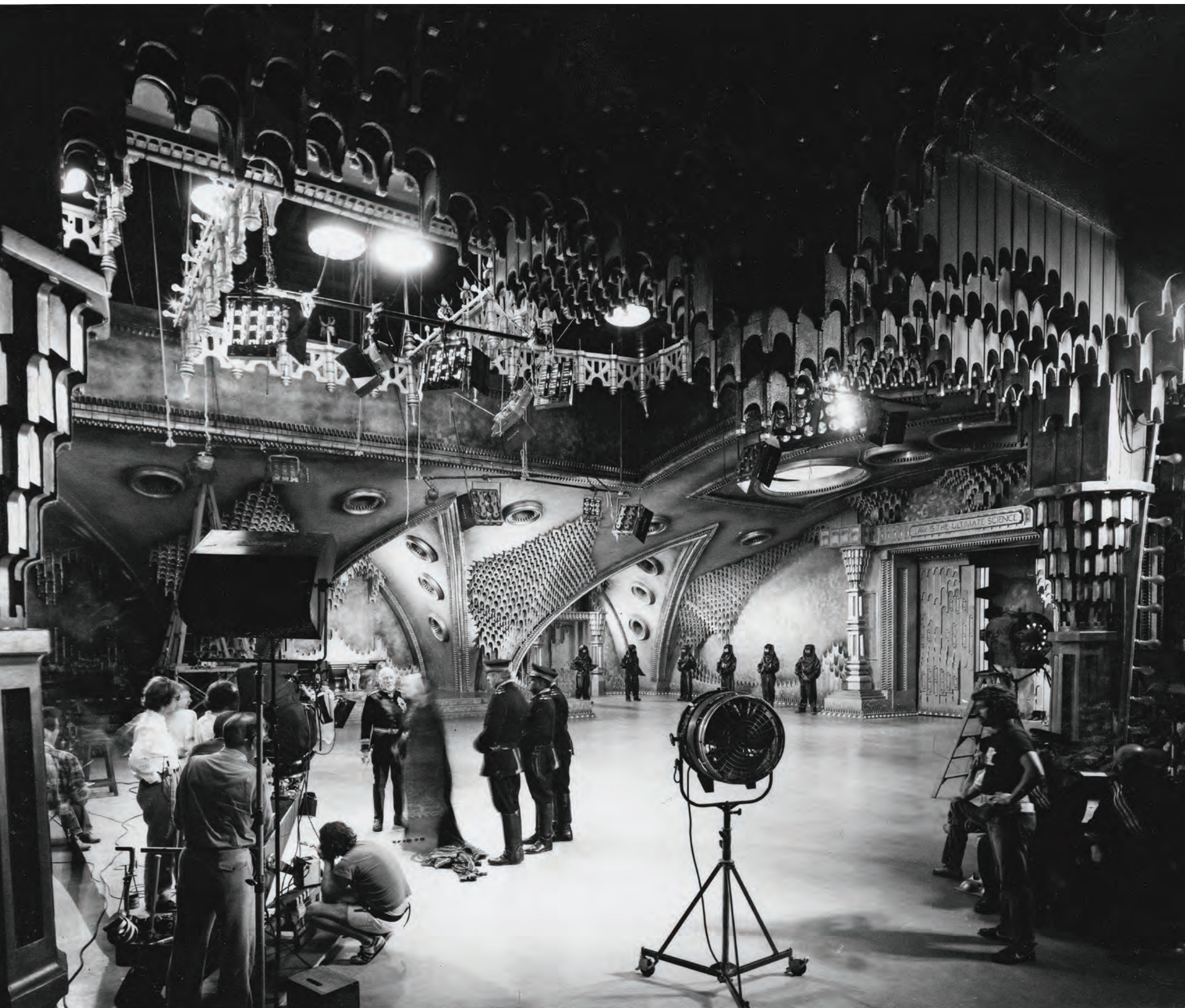
SPACED OUT: David Lynch (left, in white shirt) shot Dune (1984), adapted from the first of Frank Herbert's series of sci-fi novels, at Churubusco Studios in Mexico City because of its proximity to the desert and the favorable currency exchange. The film required 80 sets on 16 soundstages and a crew of 1,700. Lynch worked on it for three and a half years.