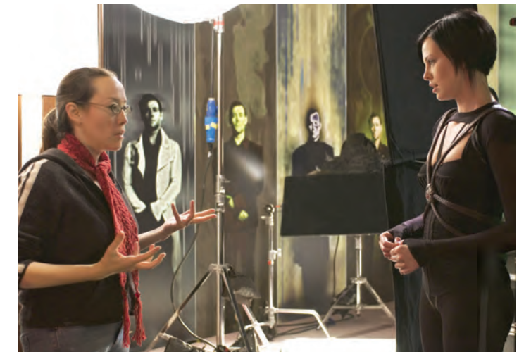
CYBERPUNK: Aeon Flux (2005), Paramount's $62 million project starring Charlize Theron, was admittedly "an unexpected step" for indie-minded Karyn Kusama (left). "But because I loved the script, it felt natural." In the film, set in 2415, 99 percent of the world's population has been wiped out.