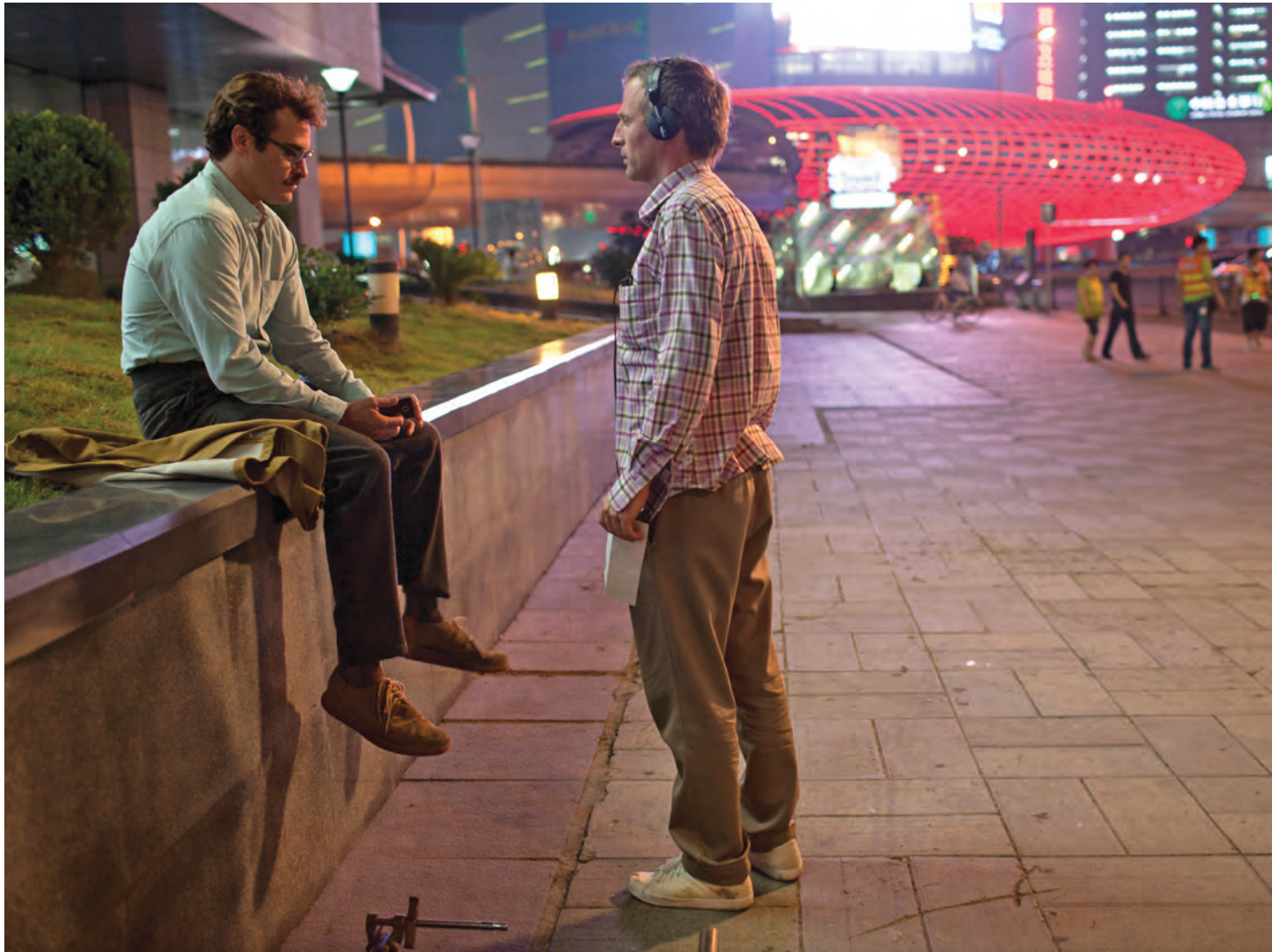
TOMORROW TODAY: Most of the city backgrounds for Spike Jonze's Her (2013), starring Joaquin Phoenix (left), especially the ones featuring skyscrapers, were filmed in Shanghai. Although the film takes place in LA, Jonze felt that present-day Shanghai had the right look to convincingly play the city in a not-too-distant future.