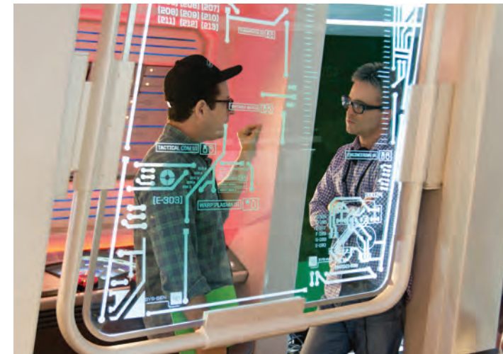
FINAL FRONTIER: Paramount asked J.J. Abrams (left) to make Star Trek Into Darkness (2013) in 3-D. But he wanted to shoot two-dimensionally on film using IMAX cameras. The compromise solution made it the first feature film shot in IMAX and converted to 3-D in postproduction.