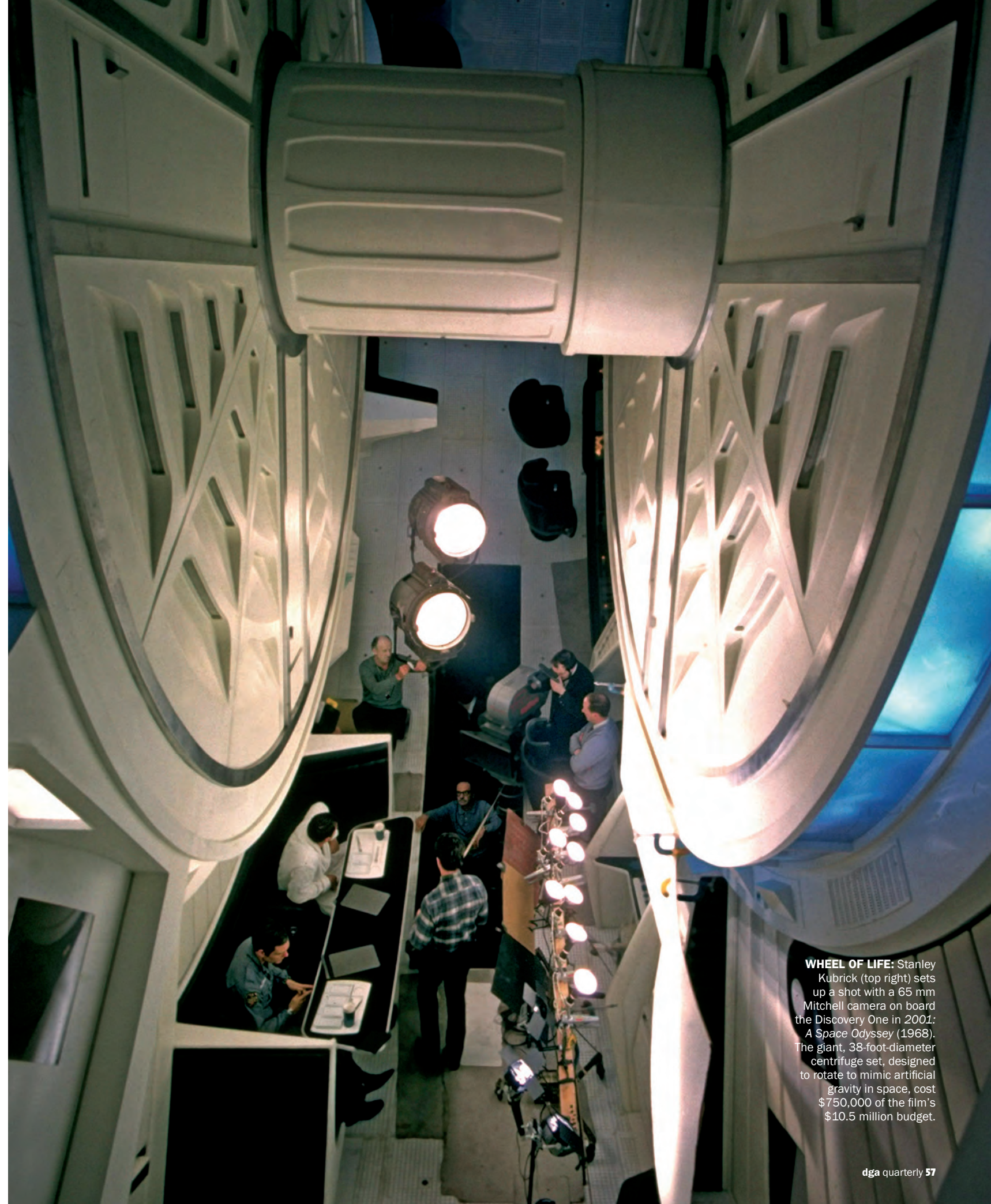
WHEEL OF LIFE: Stanley Kubrick (top right) sets up a shot with a 65 mm Mitchell camera on board the Discovery One in 2001: A Space Odyssey (1968). The giant, 38-foot-diameter centrifuge set, designed to rotate to mimic artificial gravity in space, cost $750,000 of the film's $10.5 million budget.