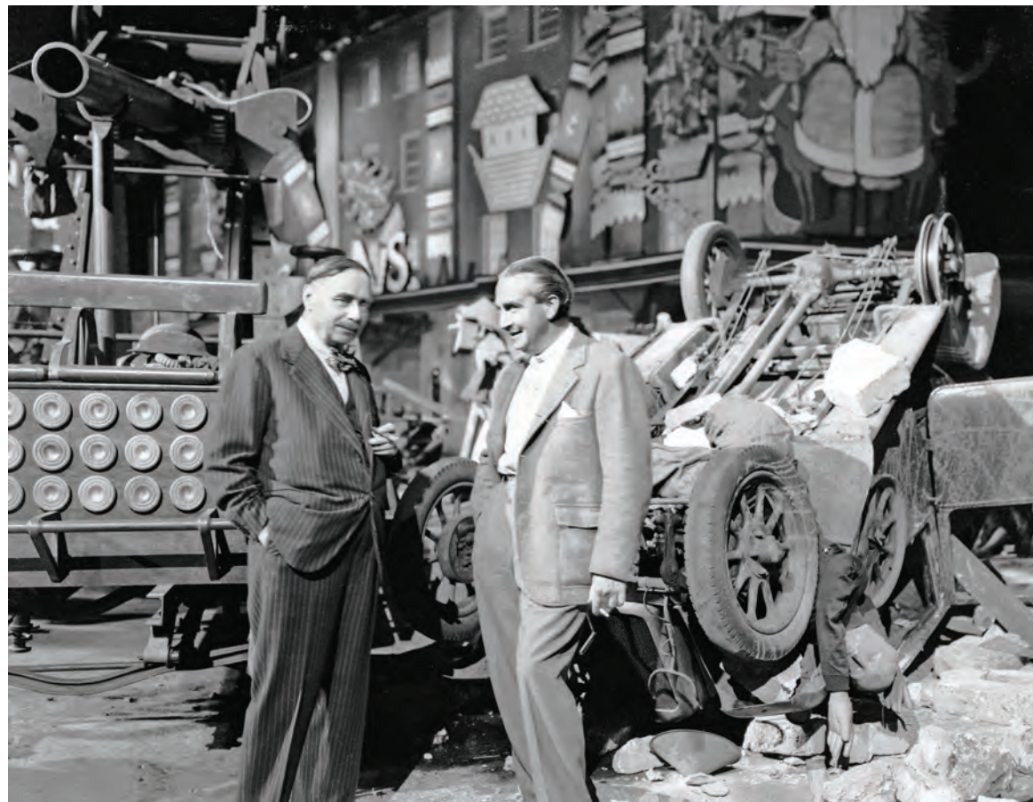
LOOKING AHEAD: William Cameron Menzies (right) on the set of Things to Come (1936) with H.G. Wells. The film is considered by many to be the first true masterpiece of science fiction cinema. It envisions the future, starting with a decades-long war in 1940 through the launch of the first manned flight around the moon in 2036.