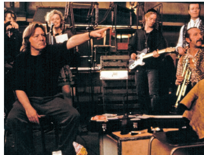
SOUL MUSIC: Alan Parker said he made The Commitments (1991), about a Dublin band, because it combined the two elements he was most comfortable with: staging musical scenes and working with young people. He assembled his cast of non-pros based on musical ability rather than acting experience.