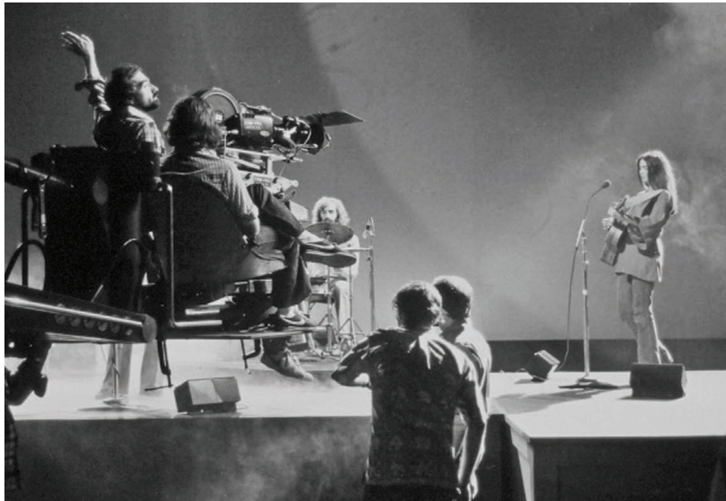
THE END: Martin Scorsese meticulously storyboarded shots to fit the lyrics of songs for The Last Waltz (1978). After the concert at San Francisco's Winterland on Thanksgiving Day, Scorsese (on crane) filmed a few additional numbers, including this one with Emmylou Harris and The Band on an MGM soundstage.