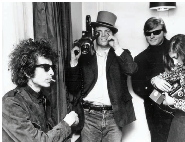
CINÉMA VÉRITÉ: D.A. Pennebaker followed Bob Dylan on tour in the UK for Don't Look Back (1967). "I was never interested in educating people about Dylan .... There are things happening all the time to real people. You don't have to enact them or write them. I'm trying to make a play, not an educational device."