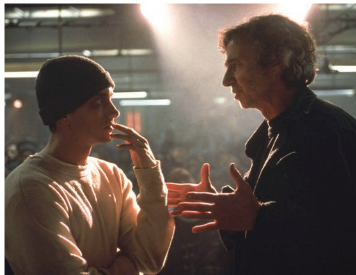
RAP: Eminem played a character much like himself in Curtis Hanson's 8 Mile (2002). Hanson placed handheld cameras in the crowd and onstage to make them a part of the action. Shooting in some of Detroit's toughest neighborhoods, his "number one objective was to try and be truthful to that world."