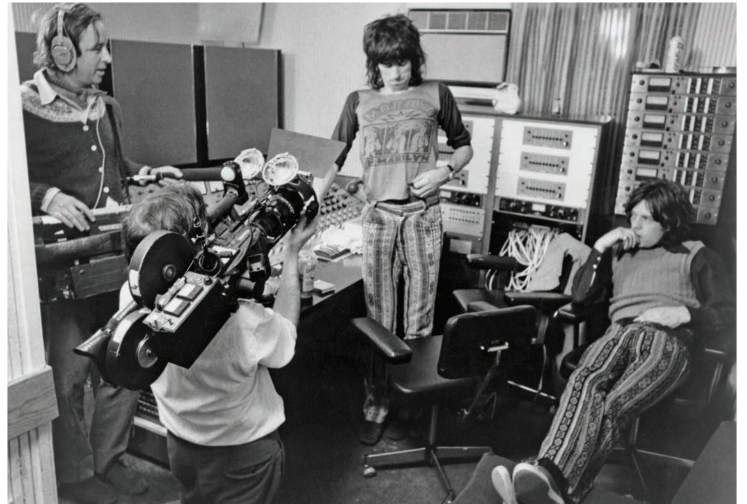
LET IT BLEED: The Maysles Brothers, in the editing room with Mick Jagger and Keith Richards, were in the right place at the right time to record the violence at a Rolling Stones concert at the Altamont Speedway in Gimme Shelter (1970). By simply observing events as they unfolded, "in a way, we not only captured history, we made it."