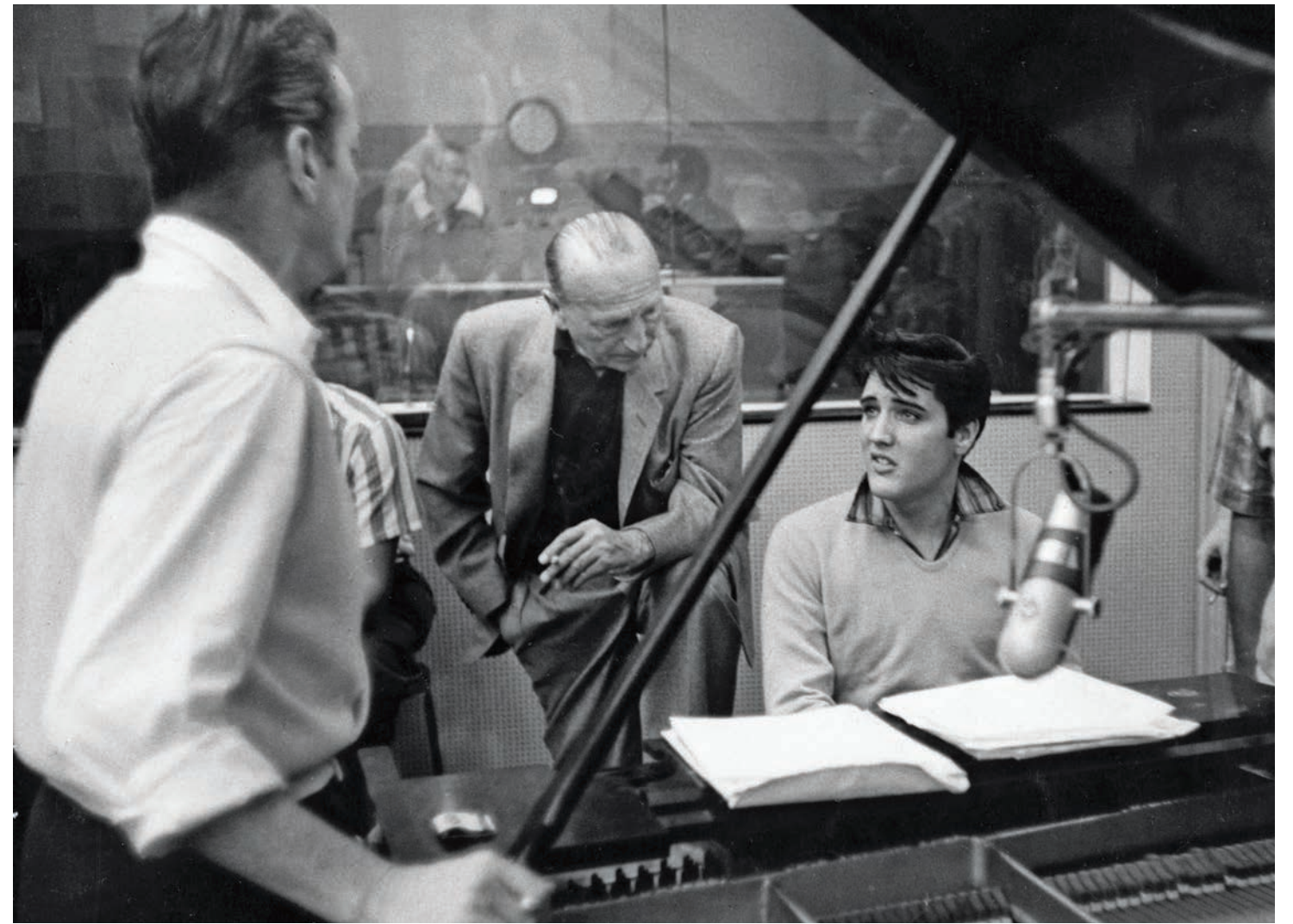
ROYALTY: A long way from his biggest hit, Casablanca , Michael Curtiz turned King Creole (1958), a standard Elvis Presley vehicle, into a darker and deeper film noir. He insisted on shooting in black and white for dramatic effect and limited the musical numbers to when the character would actually sing.