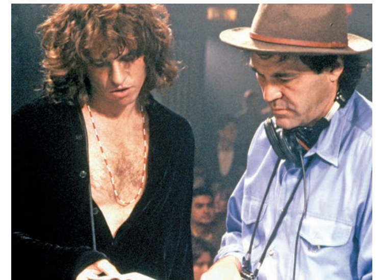
LIZARD KING: Oliver Stone working with Jim Morrison's doppelganger Val Kilmer on The Doors (1991). Stone picked the songs he wanted to use and created scenes to match the mood. He based concert sequences on the orgy scene in C.B. DeMille's The Ten Commandments , using Kilmer's voice for close shots.