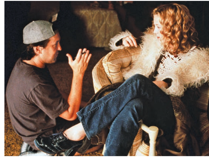
SONGS OF INNOCENCE: Based on Cameron Crowe’s experience as a teenage journalist on tour with rock bands for Rolling Stone , Almost Famous (2000), starring Kate Hudson, captures “the way it felt to be 15 and falling in love with life and music.” Crowe had the fictional band Stillwater practice for six weeks.