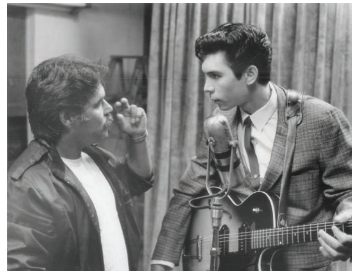
LET'S GO: Luis Valdez's La Bamba (1987) followed the brief rock 'n' roll stardom of Ritchie Valens (Lou Diamond Phillips) before he was killed in a plane crash with Buddy Holly ("the day the music died"). Valdez fleshed out the film with details about Valens' family, and Valens' songs were performed by Los Lobos.