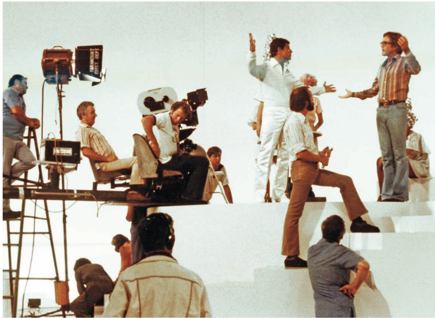
THE WORD: Randal Kleiser directs Frankie Avalon for the “Beauty School Dropout” number in Grease (1978). In adapting the play, Kleiser decided which numbers to keep and how to shoot them. The opening scene was filmed at Leo Carrillo State Park in Malibu and the exteriors of Rydell High at Venice High.