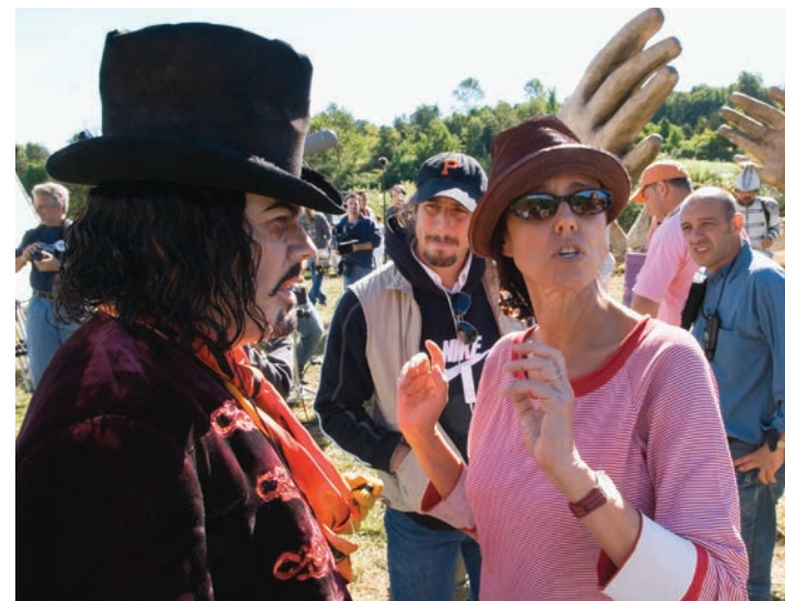
A SPLENDID TIME: Julie Taymor directs Eddie Izzard as the ringmaster of a hippie circus in the "Being for the Benefit of Mr. Kite!" number from Across the Universe (2007). Taymor played with elements of theater and film in a phantasmagoria of 33 Beatles songs used to propel a '60s romance.

PHOTOS: (TOP) RED RIVER ROAD, (BOTTOM, LEFT) EVERETT, (BOTTOM, RIGHT) COLUMBIA PICTURES