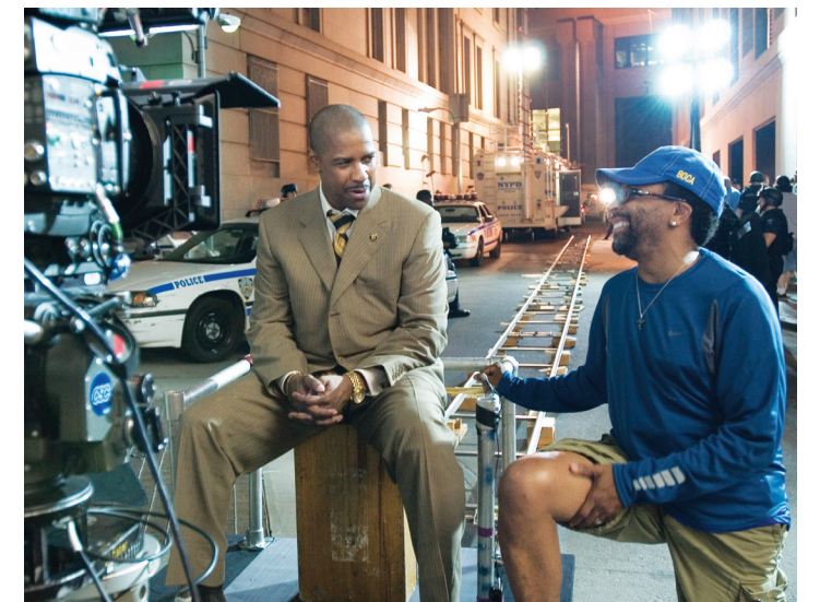
DOWNTOWN: Spike Lee, who has often used the city as a backdrop for his films, stages a scene with Denzel Washington for Inside Man (2006). Lee is sitting on a camera platform that is set up to dolly almost the entire length of William Street toward Wall Street at the end of the block.