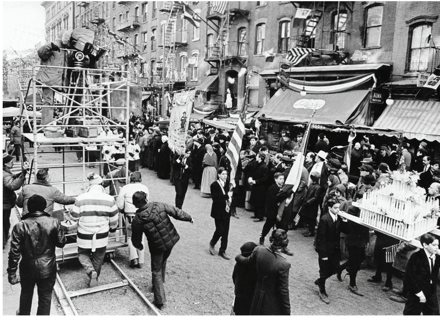
OLD WORLD: Francis Ford Coppola (in striped coat) redressed East Sixth Street near Avenue A to look like it did in 1917 for The Godfather: Part II (1974). "My heart was really in the Little Italy sequences, in the old streets of New York, the music, all that turn-of-the-century atmosphere," said Coppola.