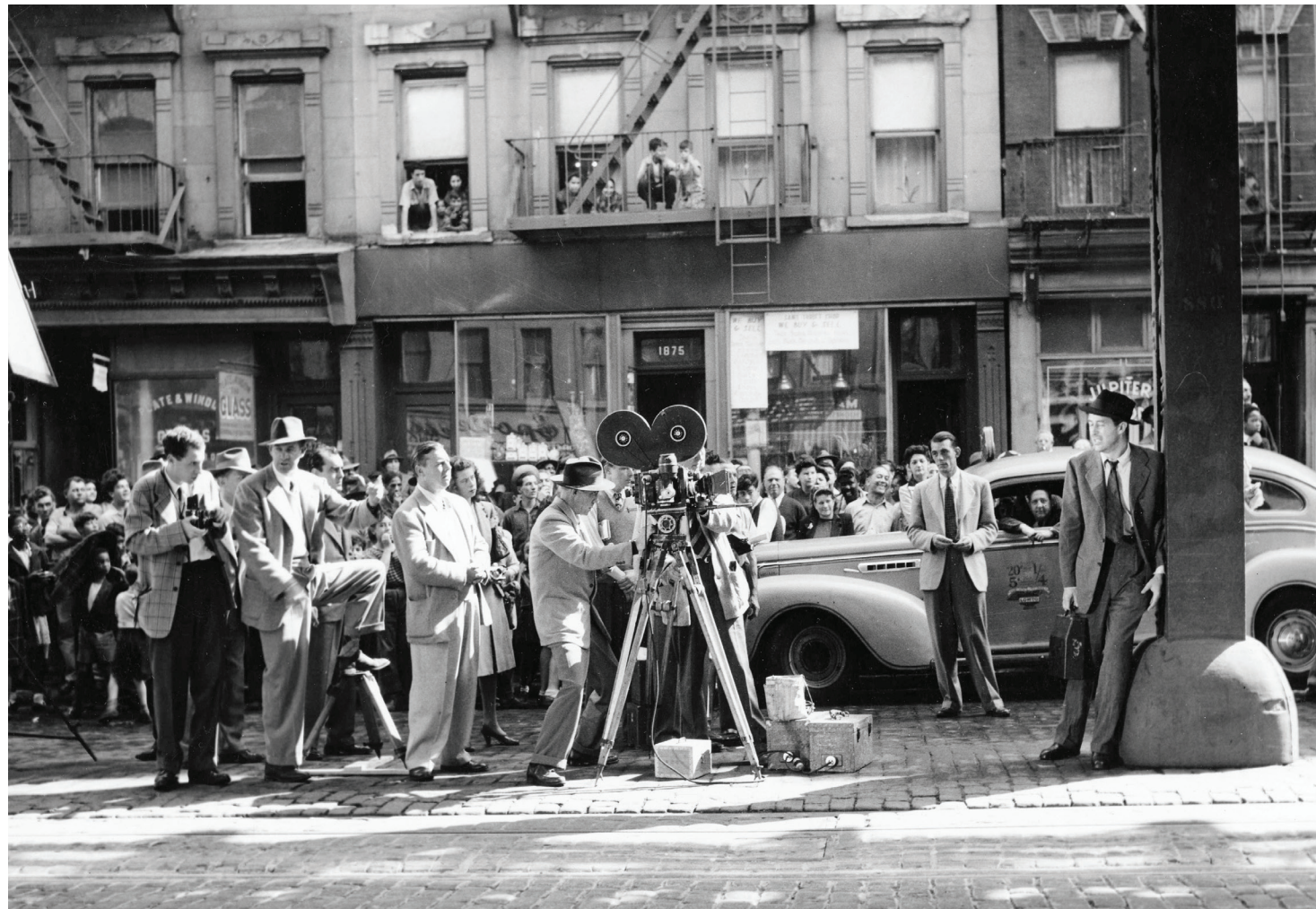
THE LUSH LIFE: Ray Milland (right) portrayed an alcoholic in a downward spiral in Billy Wilder's The Lost Weekend (1945). Wilder (behind the camera) was one of the first filmmakers to return to New York after the war. He shot exteriors on a single Sunday, hiding his cameramen inside bakery trucks.