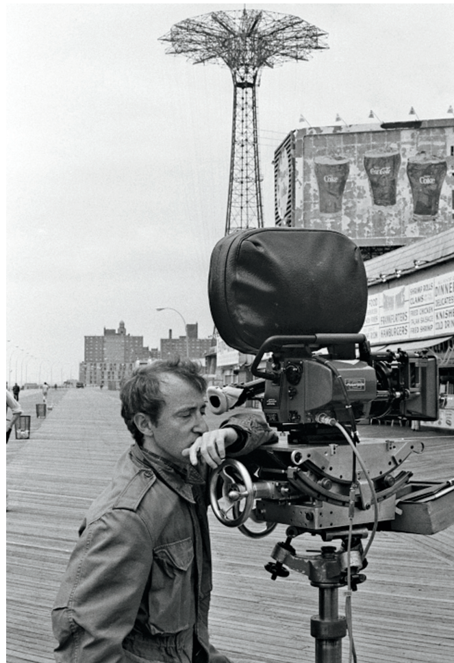
ON THE BOARDWALK: Woody Allen used actual Coney Island locations in Annie Hall (1977) for the childhood flashbacks of his alter ego Alvy Singer, who grew up under the roller coaster. With careful framing and a few period details, Allen was able to suggest how the amusement park looked during the war years.