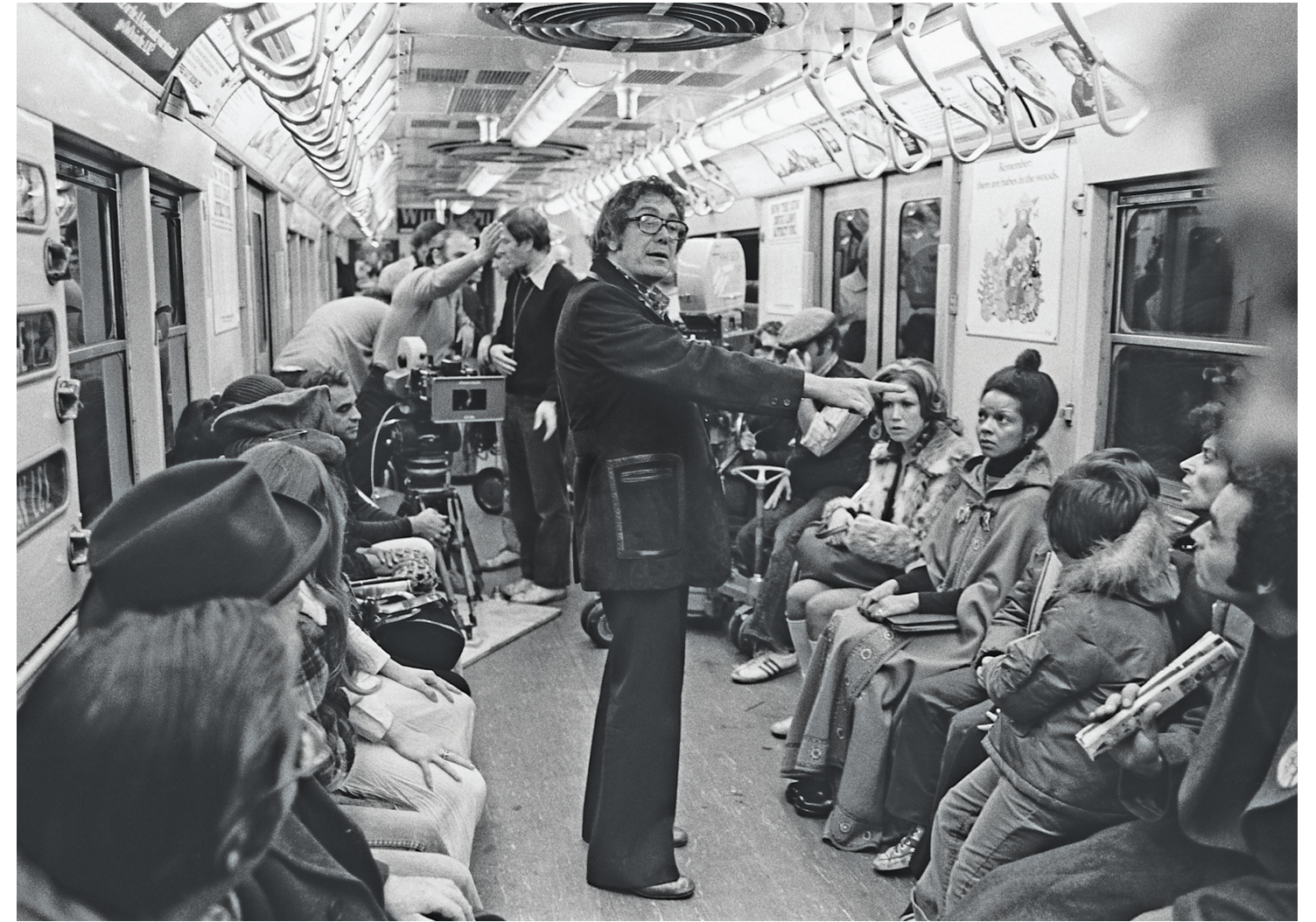
TAKE THE A TRAIN: Director Joseph Sargent shot The Taking of Pelham One Two Three (1974) on a subway car rented from the Transit Authority. He also attached a lightweight Arriflex camera to the exterior of the car with an aluminum rig and heavy-duty suction cups to shoot the train as it pulled out of the station.