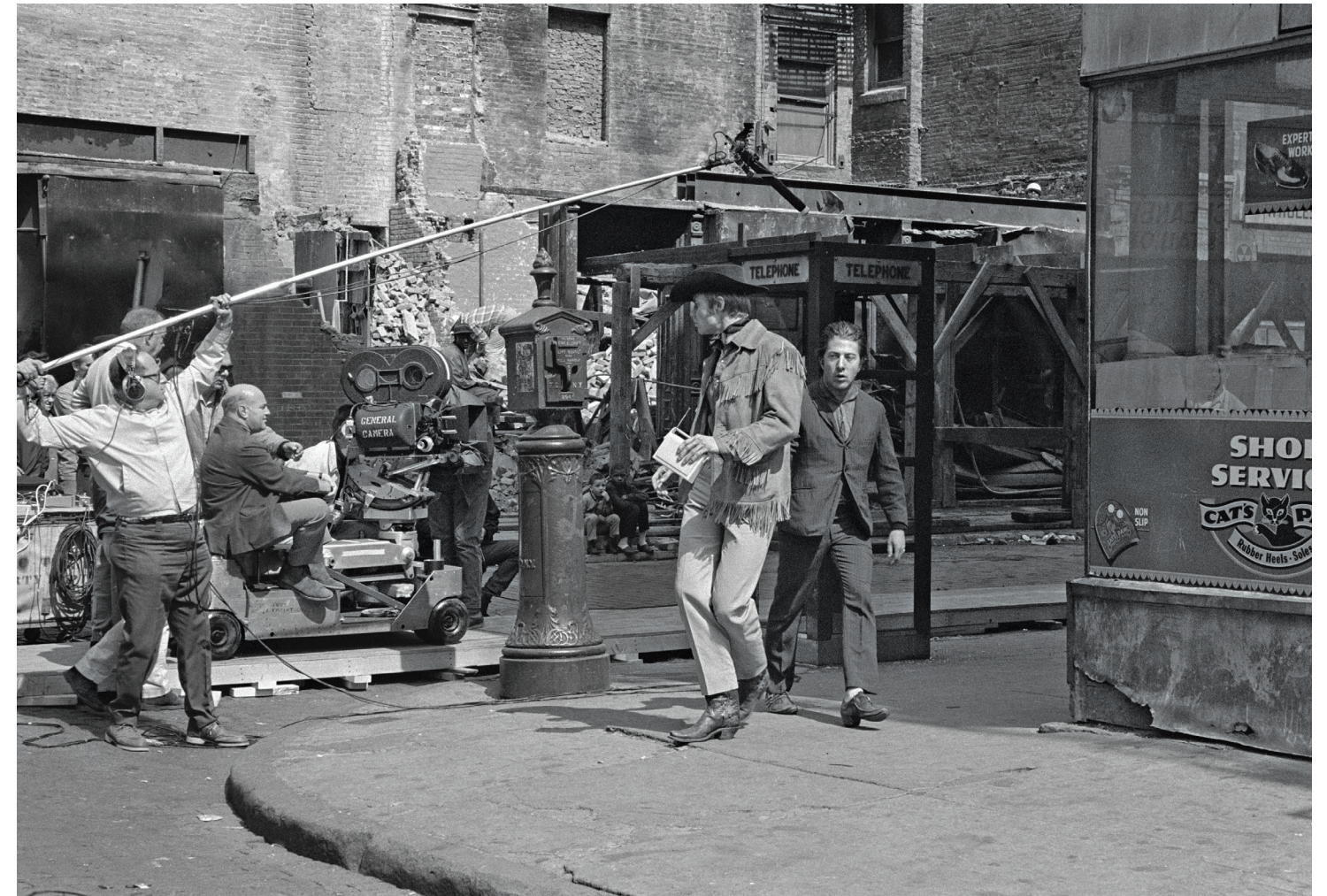
STREET LIFE: John Schlesinger (seated) directing Jon Voight and Dustin Hoffman in Midnight Cowboy (1969). Schlesinger said he actually made New York a character in the film. "It's the one city in the world that leaves me feeling that I can't believe my eyes. So it can't help being a character."