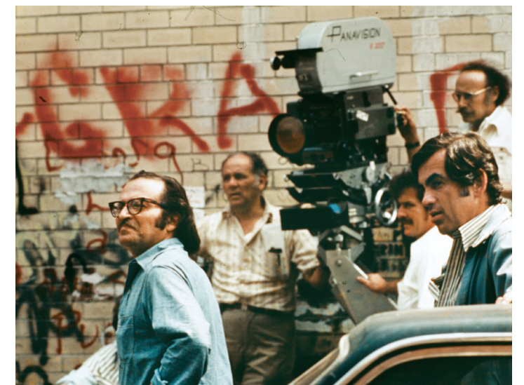
TRUE GRIT: The quintessential New York director, Sidney Lumet used 104 locations in every borough except Staten Island to shoot his police corruption film Serpico (1973). "When you shoot here, it's like sitting on a big lid ready to blow sky high. And this energy reaches the screen."