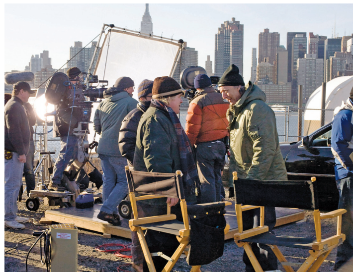
CITY OF DREAMS: Philip Seymour Hoffman (center), making his debut behind the camera in Jack Goes Boating (2010), called directing a "great gig," but in the future would prefer not to act and direct. Playing a limousine driver, Hoffman and his best friend sit in the car admiring the unattainable towers of Manhattan.