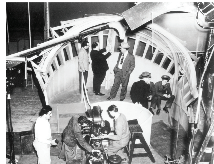
TOP OF THE WORLD: Alfred Hitchcock (center) built a model of the Statue of Liberty to scale on the Universal lot for Saboteur (1942). For the finale of the film, real footage shot from the top of the monument was superimposed onto a black background to make it appear that the villain had fallen down.