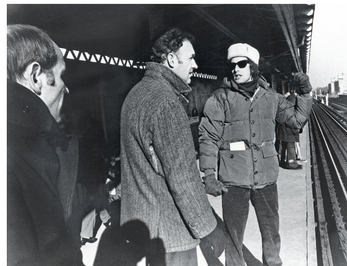
RUSH HOUR: William Friedkin (right) with Gene Hackman, at a subway station making The French Connection (1971). The great chase scene on the Stillwell Avenue elevated line in Brooklyn was shot in the dead of winter over a period of five weeks, but the production could only shoot from 10 a.m. to 3 p.m.