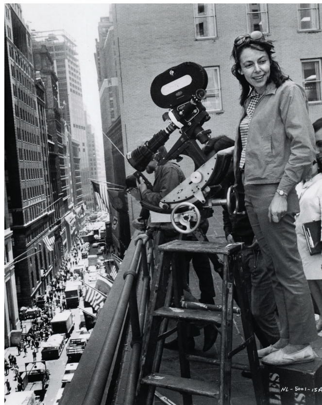
UPTOWN: Elaine May shot her first feature, A New Leaf (1971), in Manhattan and Queens. The original ending of the corrosive black comedy about two wealthy misfits (Walter Matthau and May) was too dark for the studio, and despite favorable reviews she was unhappy with the edited version.