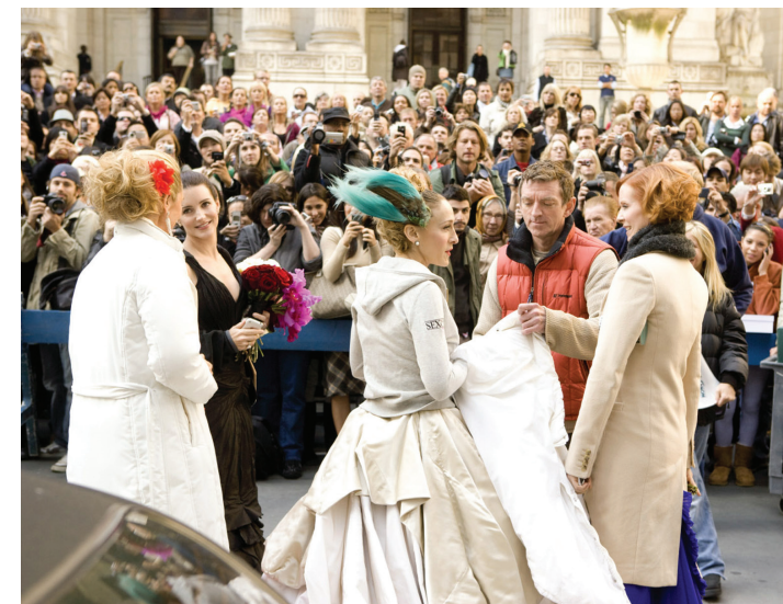
DRAWING A CROWD: When he was making Sex and the City (2008), Michael Patrick King had to add several outdoor scenes as a decoy for the ever-present paparazzi, and several exterior scenes had to be moved indoors because of media attention. But not the wedding scene, filmed outside the New York Public Library.