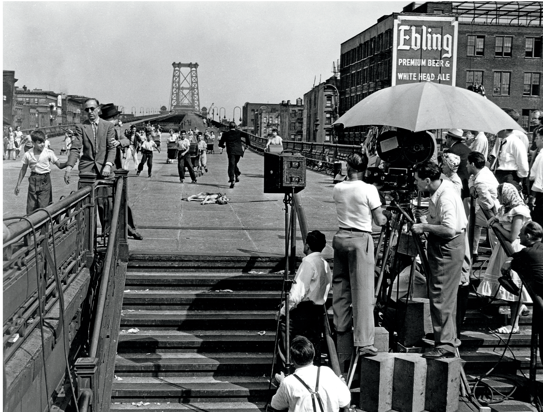
DOG DAYS: Jules Dassin's The Naked City (1948), a movie shot almost entirely on location in New York, was a breakthrough for the film industry. Dassin (in white T-shirt) shot at 107 sites around town in the summer of 1947, climaxing with this final chase scene on the walkway of the Williamsburg Bridge.