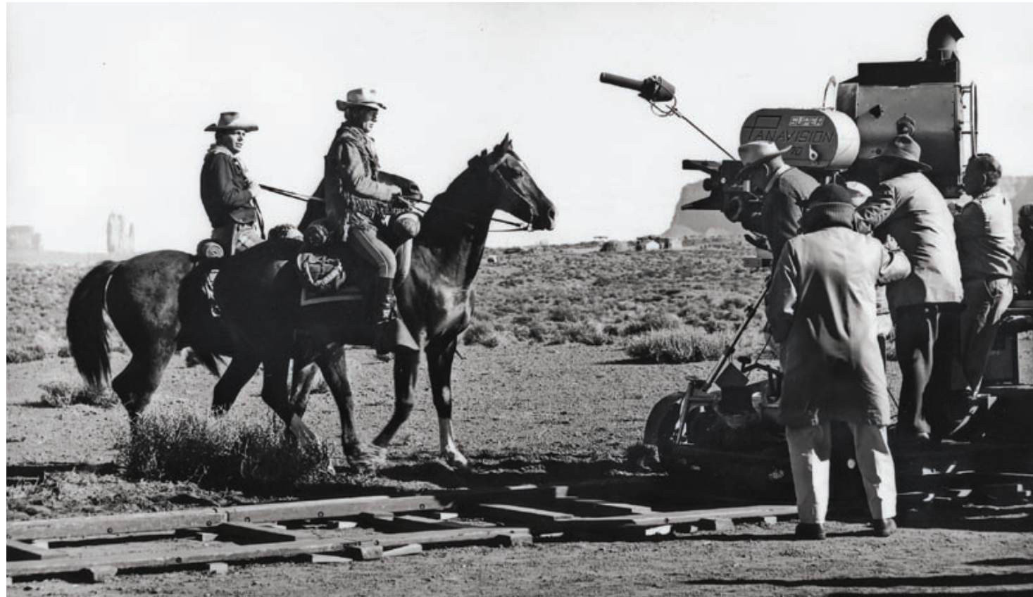
THE GOOD GUYS: (top) Cheyenne Autumn (1964) was Ford's last Western and the last film he shot in Monument Valley. He said it was an elegy for Native Americans and a chance to "show their point of view for a change." (opposite) Ford, with a visiting Tyrone Power (center) and Henry Fonda, won his second best director Oscar for The Grapes of Wrath (1940). "I bucked to do that picture and put everything I had into it."

Underdogs, families in trouble, and men at war inspired John Ford to create movies of grandeur, grace, and, yes, beauty. Here he is capturing the inherent decency of people in films from his unparalleled body of work.