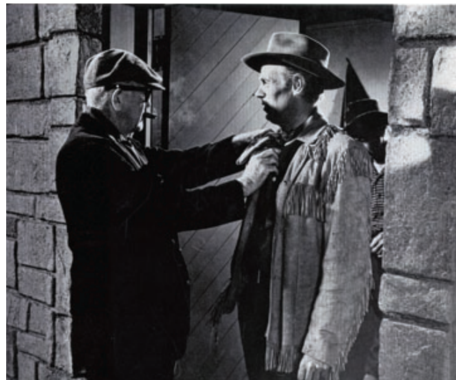
LOOKING GOOD: Richard Widmark (right) starred with James Stewart in Two Rode Together (1961). For a five-minute two-shot of the actors on a river bank, the crew had to wade waist-deep into the water and stay there all day until the shot was completed.