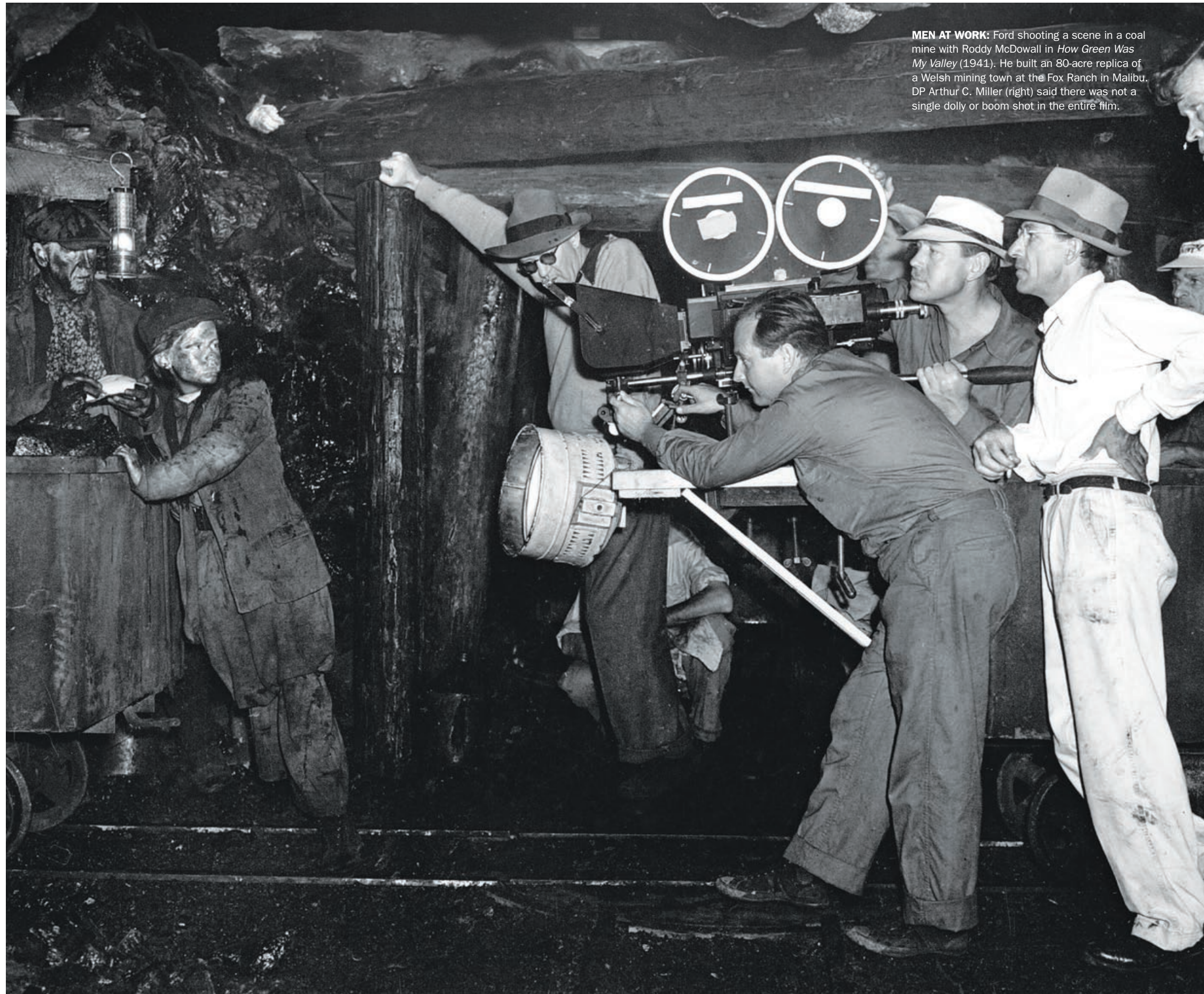
MEN AT WORK: Ford shooting a scene in a coal mine with Roddy McDowall in How Green Was My Valley (1941). He built an 80-acre replica of a Welsh mining town at the Fox Ranch in Malibu. DP Arthur C. Miller (right) said there was not a single dolly or boom shot in the entire film.