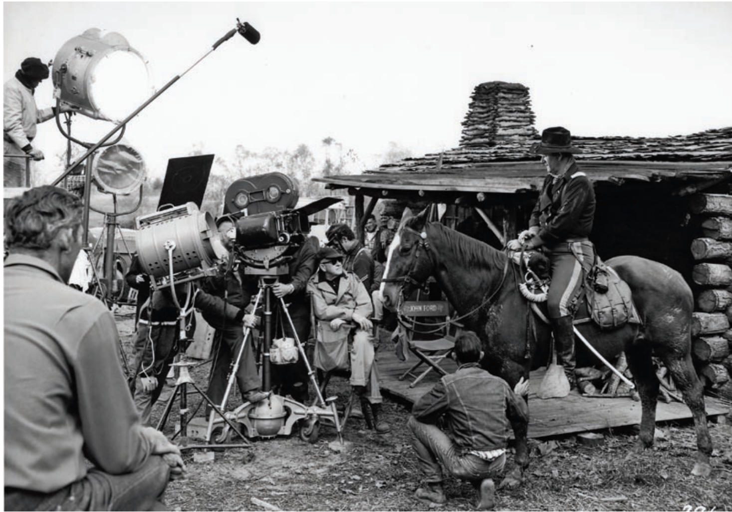
RANGE ROVER: John Wayne played a union soldier who leads a raid behind enemy lines to blow up the Confederate railroad in The Horse Soldiers (1959). It was Wayne's 12th collaboration with Ford. The film was shot on locations in Louisiana and Mississippi.