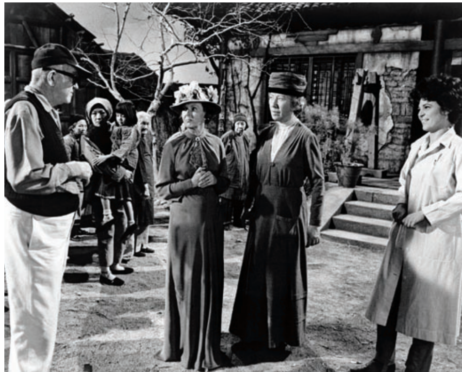
CHINATOWN: Anne Bancroft (right) starred in 7 Women (1966), about a group of women besieged by bandits in Mongolia. Ford shot the first part with dull, washed-out colors and then unleashed a full range of color when the Mongols attack. It was his last film.