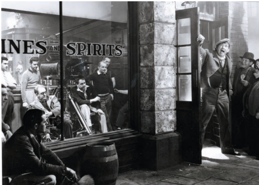
IRISH WHISKEY: Ford filming Victor McLaglen from behind in The Informer (1935). He had been impressed by Murnau's Sunrise and brought a German Expressionist look to the picture. Shot in 17 days for $243,000, it won four Oscars, including best director.