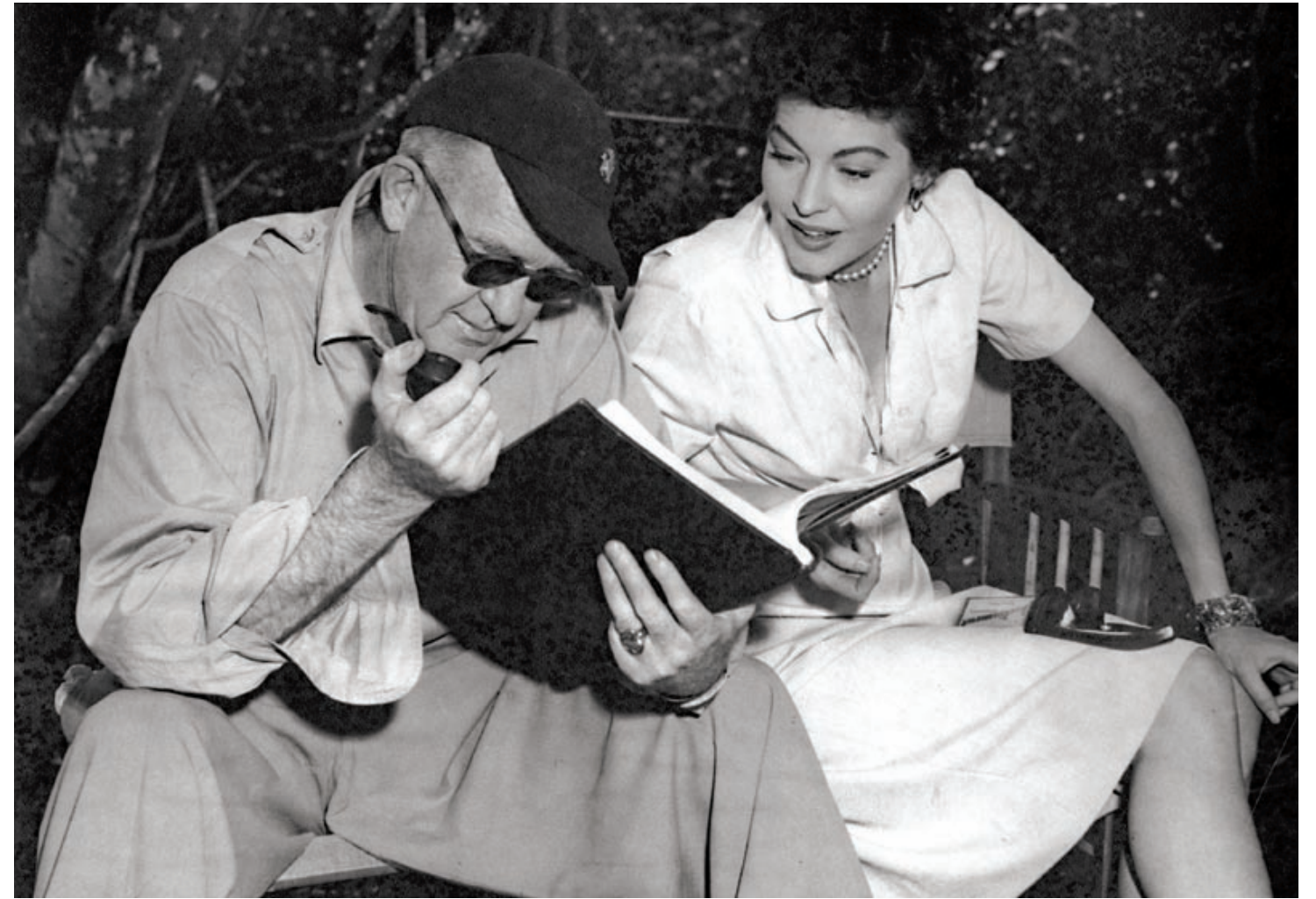
BY THE BOOK: Ford and Ava Gardner study the script from Mogambo (1953). Gardner said of Ford: "The meanest man on earth. Thoroughly evil. Adored him!" Although most of it was shot in the studio, the film took wildlife shots in Africa.