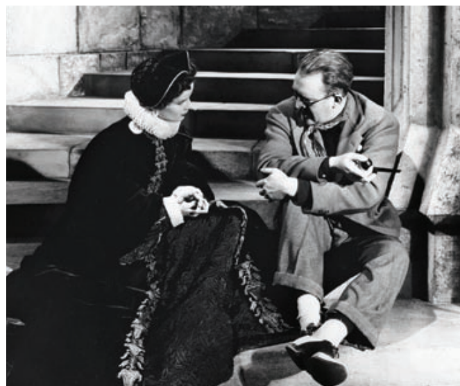
ROYALTY: Mary of Scotland (1936), a rare romantic costume drama for Ford, about Mary Stuart's troubled reign, was the only film Katharine Hepburn made with him. She said his major gift as a director was to make action on the screen look like it just happened.