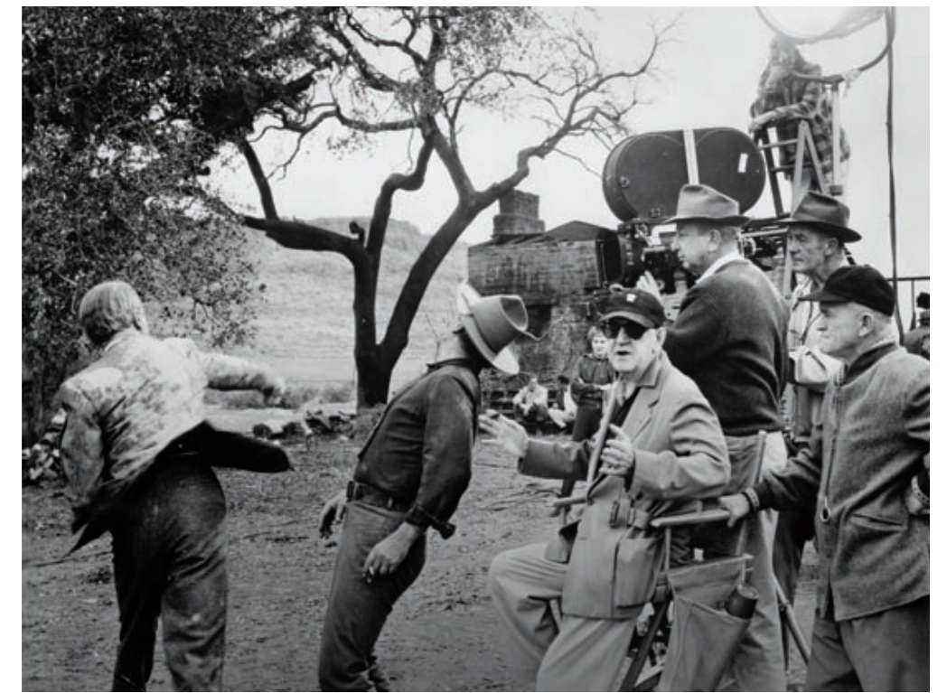
TAKE THAT: Ford stages a fight between James Stewart (left) and John Wayne in The Man Who Shot Liberty Valance (1962). In a cost-cutting measure, the film was shot in black and white on Paramount's backlot, a departure from Ford's color films of the period.