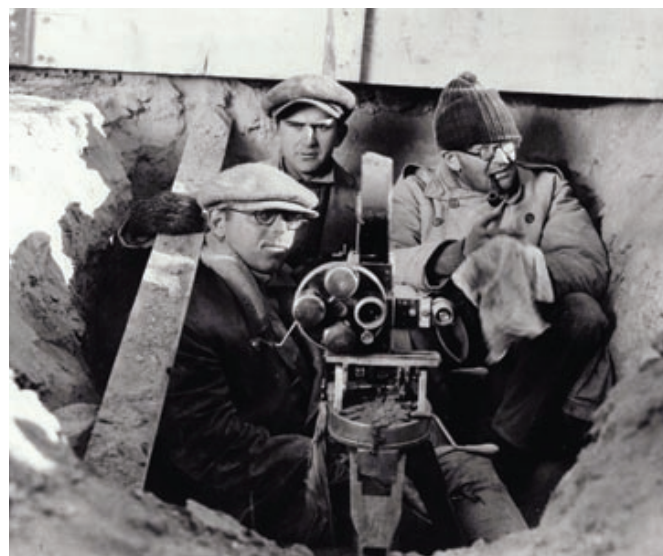
IN THE TRENCHES: The silent The Iron Horse (1924), about the building of the first transcontinental railroad, was the first major success for Ford (right). Two entire towns were constructed, and 5,000 extras, 1,300 buffalo, 2,000 horses, and 10,000 cattle were used.