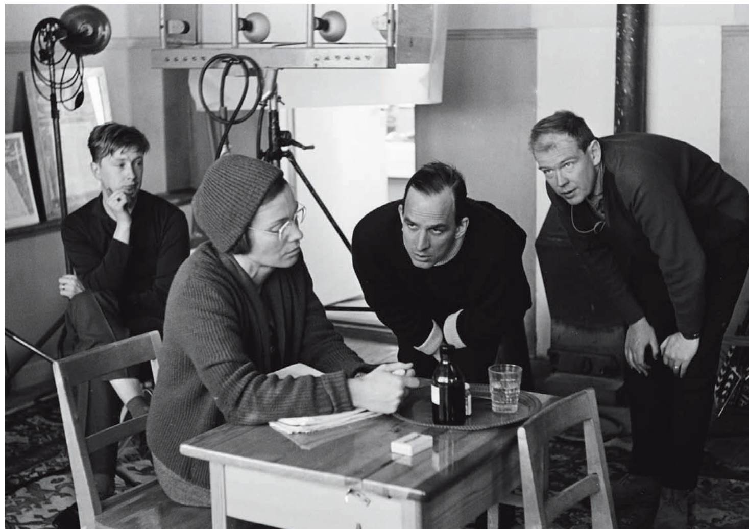
LIGHT YEARS: For Winter Light (1963), which takes place mostly in a church in daylight over three hours, Bergman, with Ingrid Thulin and Nykvist, wanted an almost imperceptible change in the quality of the light. "Light and faces surrounded by shadows. This is what fascinates me."