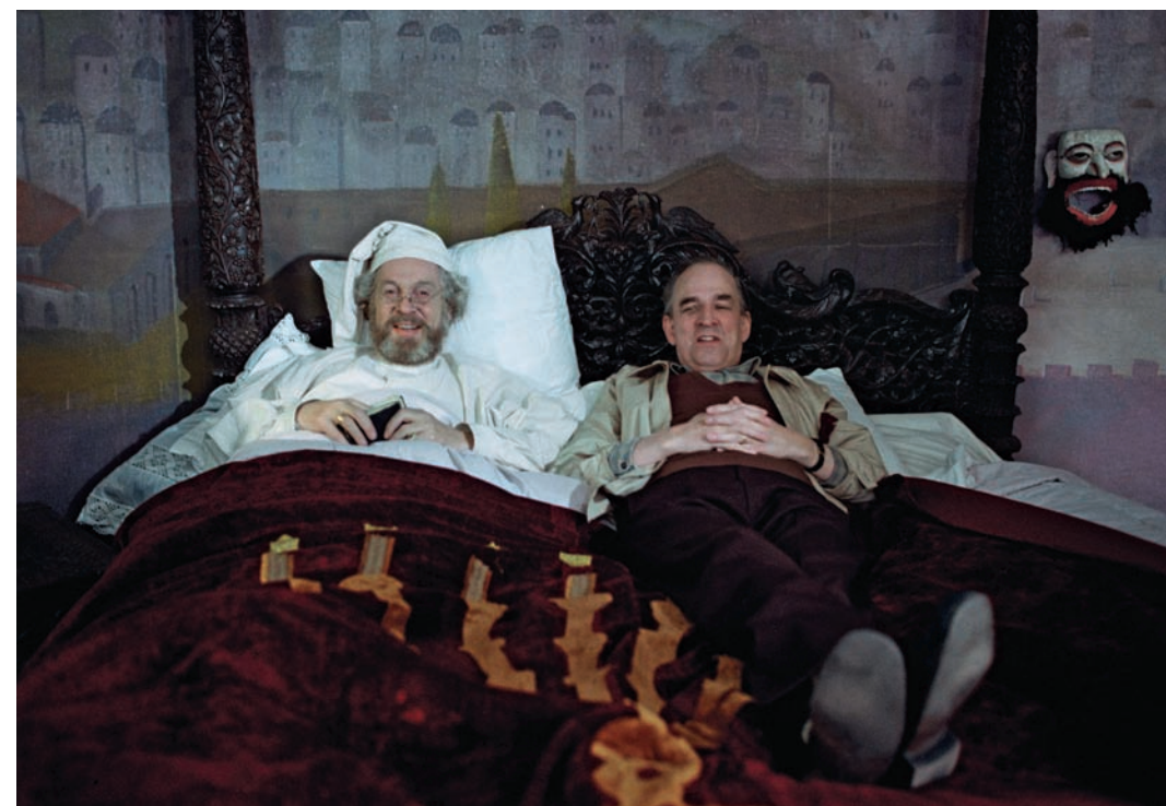
TAKE FIVE: Bergman relaxes between takes on the set of Fanny and Alexander (1982) with his friend and colleague of 40 years, Erland Josephson. "There is a sensual satisfaction in working in close union with strong, independent, and creative people. Sometimes there is a special happiness in being a film director."