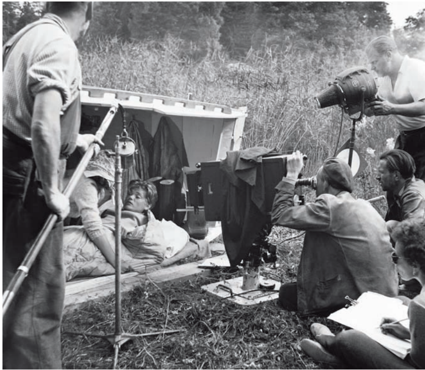
OUTSIDE THE BOX: For Summer With Monika (1953), with Harriet Andersson, it was difficult to shoot the interior of a boat, so Bergman rigged this enclosed set. "There has never been a girl in Swedish films who radiated more erotic charm than Harriet," Bergman said. Cut by Swedish censors, it was released in the U.S. as Monika: The Story of a Bad Girl .