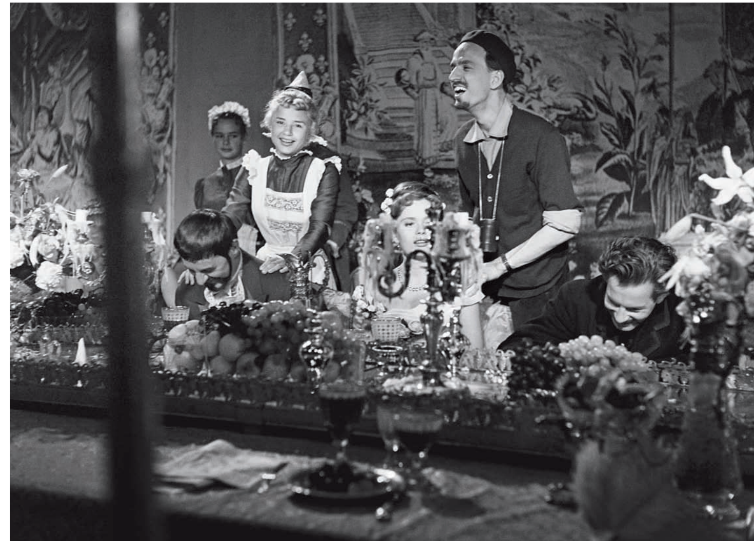
LIFE OF THE PARTY: Bergman shot much of his sex farce Smiles of a Summer Night (1955) in medium-long shots to allow the characters to move within the frame and sort things out for themselves. "Comedy is a genre with terrific demands for precision, lightness and body."