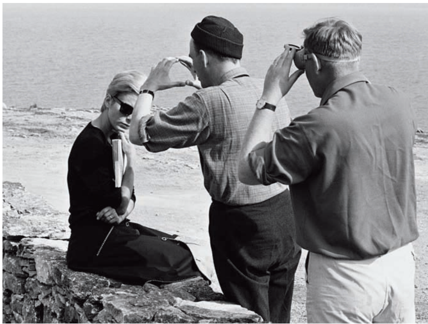
DOUBLE VISION: Bergman and cinematographer Sven Nykvist shot Persona (1966), with Bibi Andersson, almost exclusively in close-ups and wide shots. He considered the close-up "the height of cinematography" because it gave him "that incredibly strange and mysterious contact you can suddenly experience with another soul."