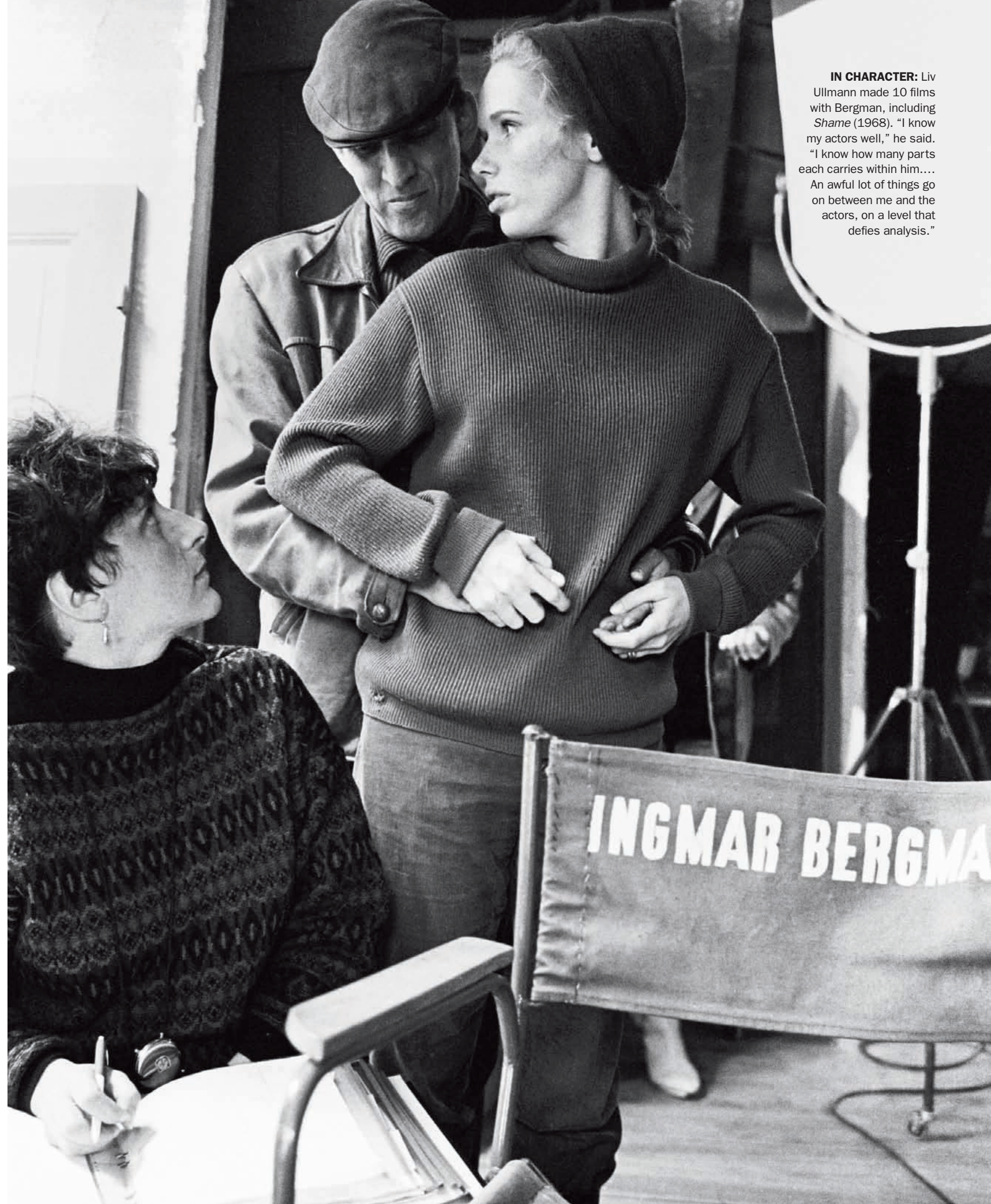
IN CHARACTER: Liv Ullmann made 10 films with Bergman, including Shame (1968). "I know my actors well," he said. "I know how many parts each carries within him.... An awful lot of things go on between me and the actors, on a level that defies analysis."