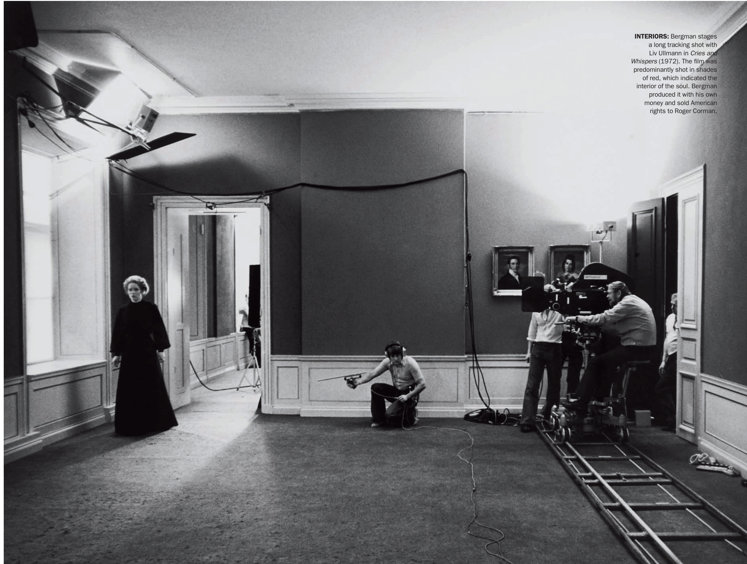
INTERIORS: Bergman stages a long tracking shot with Liv Ullmann in Cries and Whispers (1972). The film was predominantly shot in shades of red, which indicated the interior of the soul. Bergman produced it with his own money and sold American rights to Roger Corman.