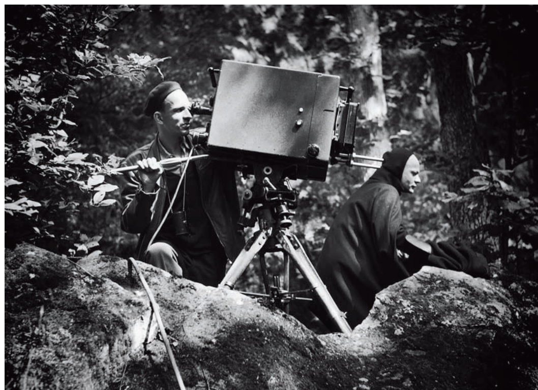
KISS OF DEATH: Bergman called The Seventh Seal (1957) a "kind of road movie, traveling without constraint in time and space." He wanted the face of Death to have the look of a white clown and a skull. "There are many directors who forget that our work in film begins with the human face."