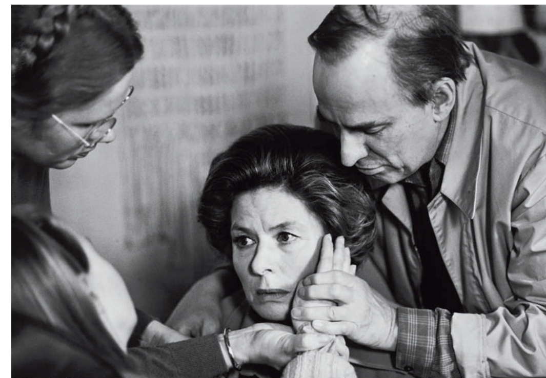
EMOTIONAL WRECK: Autumn Sonata (1978) was the first and only time Ingmar and Ingrid Bergman worked together. At first they had a combative relationship, then "the mask fell," the director said, "and the camera registered the face of a suffering human being." Said the actress, "As a director, you know he is suffering with you."